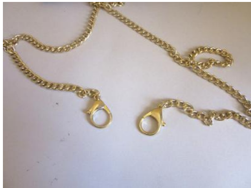
Golden Chain with 2 Carabiners