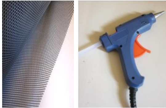
Plastic Net Hot Glue Gun