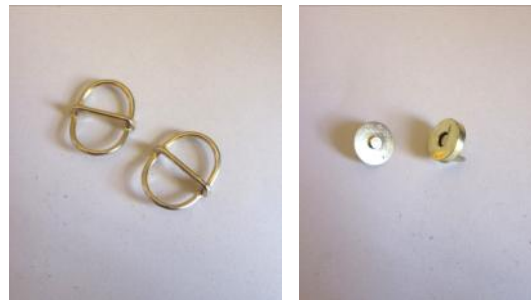
Bag Loops Magnetic Button