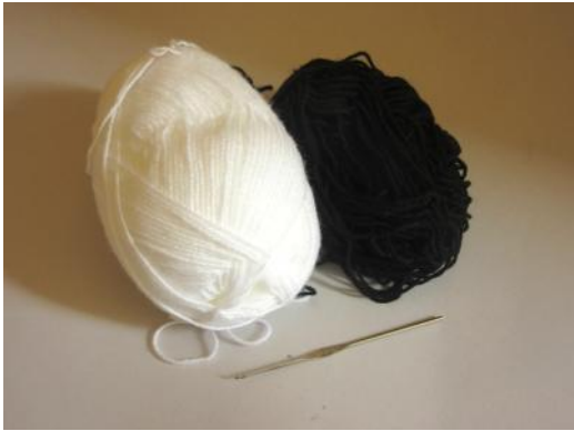
100% Acrylic Wool Crochet Hook 1.90 mm